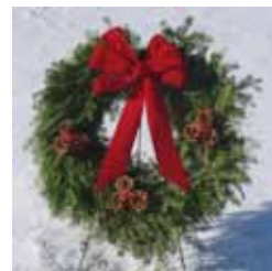
Wreaths provided by Howard's Florist

Quantity is limited! Orders will be filled while supplies last.